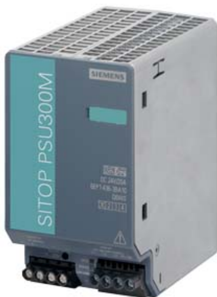
SITOP PSU300M 20 A STABILIZED POWER SUPPLY INPUT: 400-500 V 3 AC OUTPUT: 24 V DC/20 A